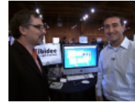
In the TechCrunch Demo Pit